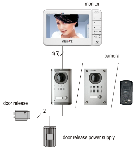
for 1 user (2 cameras, 4 monitors)